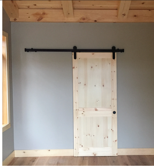
Goes with any décor